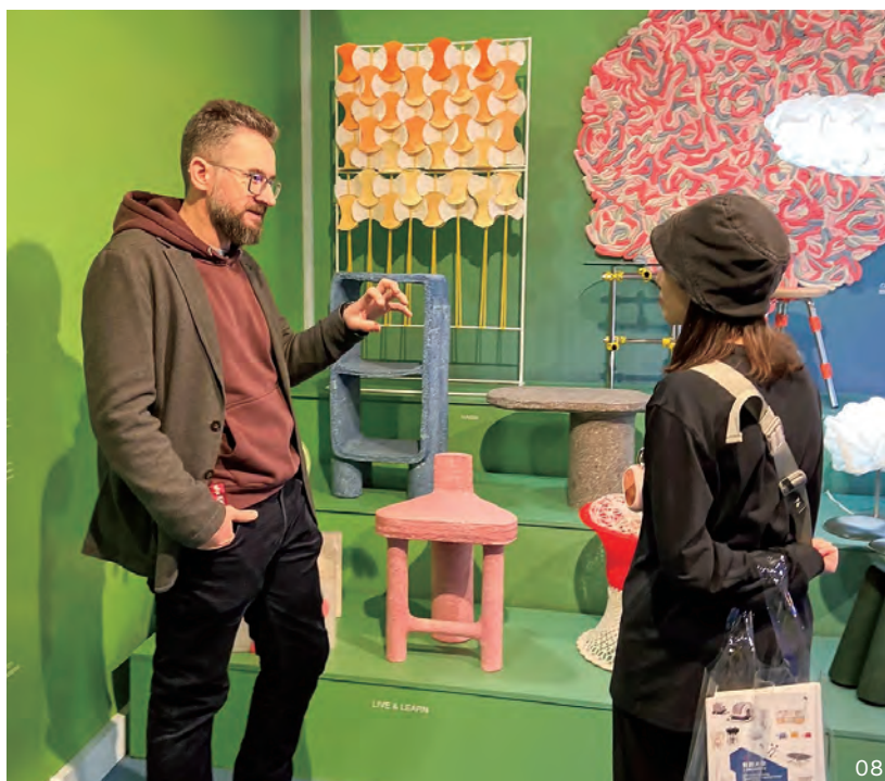
08 觀展者向參展學生熱情分享對作品的感受 A visitor shared how he felt about the work with student.