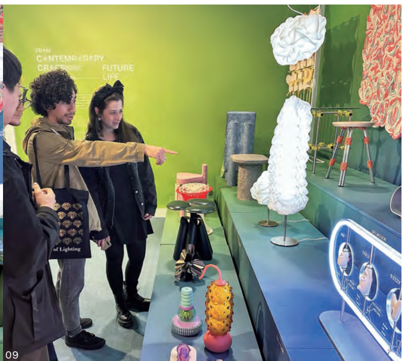
09 觀展者對於燈具製程手法產生興趣 Visitors were fascinated by the method used to make the lamps.

I am very proud of my university.” She said that both the students and faculty had invested enormous amount of time and energy, from theme setting, exhibition space arrangement, promotion strategies to training in English presentation. Despite the challenges, she felt all the efforts were worth it when visitors enjoyed their work and found a sense of identity. “Thanks to the professors and the collaboration of classmates, I had the unforgettable opportunity to learn and grow,” she said.